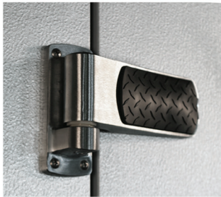
Spring Assisted Hinges