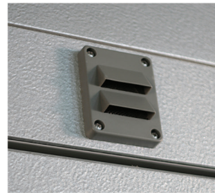
Heated-Pressure Relief Vent

The door jamb and door are constructed with a non-conductive heavy-duty PVC extrusion that provides a thermal barrier. The jamb includes an LED light fixture mounted on the center/top of the jamb, which provides extra space for shelving posts. A digital LED Thermometer (F°/C°) is provided, with On/Off pilot light switch.