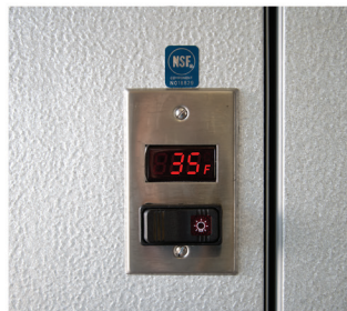
Digital LED Thermometer & Switch