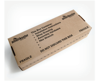
Fast & Easy Assembly

Standard door sizes are: 36", 30" or 26" wide, all with a 76" high clear opening. Doors are constructed with 4" thick AK-XPS4 rigid foam insulation and finished with 26-gauge zinc-aluminum (Acrylume®) coated steel, which is stucco embossed and coated with corrosion resistant acrylic paint.