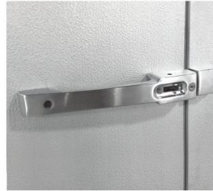
Deadbolt Keyed Handle Latch