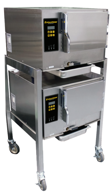
E3 Evolution™ Model shown Double Stacked on stand with optional drain pans

Evolution™ steamer is AccuTemp Products' connectionless, boilerless steam cooker that utilizes AccuTemp's patented Steam Vector Technology for faster cook times, improved energy efficiency, better pan to pan uniformity, and less water consumption. Steam Vector Technology requires no moving parts inside the cooking chamber. Steam to be produced inside the cooking cavity with no heating element exposed to water. No water or drain line. Uses less than 1.5 gallons of water per hour. Unit to include low water, high water, overtemp warning lights and auto shut off feature. Evolution™ to include heavy duty, field reversible door. Standard digital controls with independent timer. No water quality exclusions to warranty and no water filtration or treatment required. Unit to be UL Safety and Sanitation Certified, and Energy Star qualified. Built in USA.